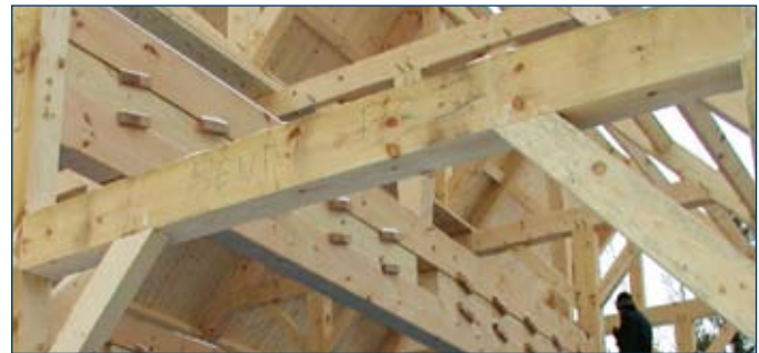
Shown here is a tri-laminate keyed beam that has a designed gap in the center lamina.

For metric tables and more standard configurations, go to the Key-Laminated Beams page on the FraserWood website.