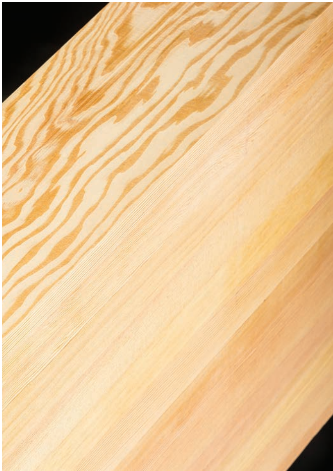
Top of Douglas fir EdgeMatched glulam showing flat-sawn grain on the narrow face with edge grain on the wide face creating a more natural appearance.