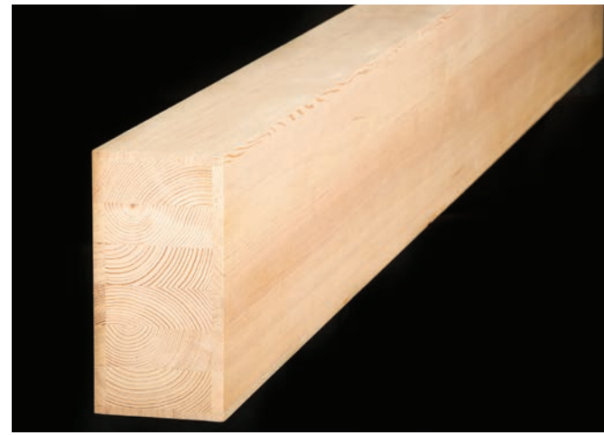
Douglas fir vertical grain on all four sides

EdgeMatched™ glulam beams are manufactured to meet the demanding APA strength, stiffness and connection capacity requirements for glue-laminated timbers. They also meet a higher standard for dimensional tolerance, stability, squareness and, above all, visual appeal. The FraserWood method of building glulam timbers yields an engineered wood product recognizable for its beauty and resemblance to solid sawn timber. With the EdgeMatched beam, FraserWood is once again “Extending the reach of natural timber.”