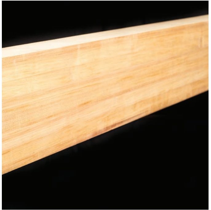
Western Red Cedar EdgeMatched Glulam

Our APA-certified manufacturing methods allow us to manufacture EdgeMatched beams to meet your specific needs. We can manufacture any standard or custom glulam dimensions specifically for your project. In addition, we also have the ability to craft the appearance of the face lamina by modifying species, thickness and grain orientation. For example, for a beam that would be featured as a column, we can expose clear vertical grain on all four faces.