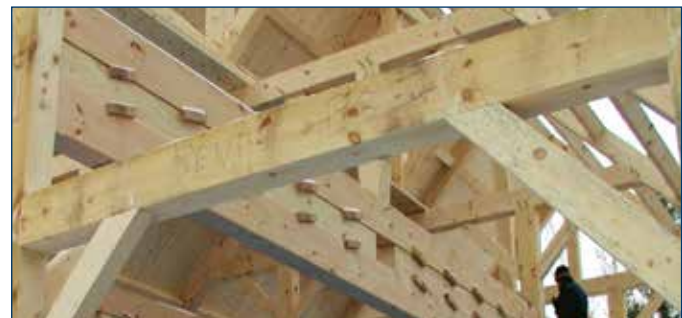
Shown here is a tri-laminate keyed beam that has a designed gap in the center lamina.

For metric tables and more standard configurations, go to the Key-Laminated Beams page on the FraserWood website.